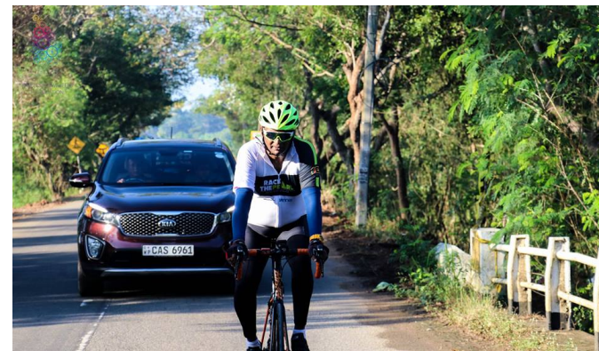
A #SafeRide is a great ride